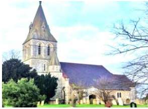
St. Andrew's Church Wraysbury