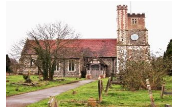
St. Michael's Church Horton