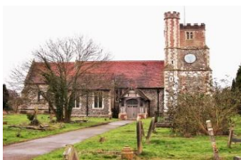
St. Michael's Church Horton